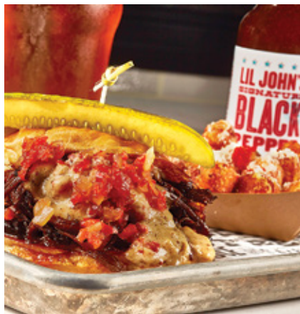
The Polite Pig's USDA Prime Brisket Sandwich

Here, you'll find everything you need to craft a new summer look amid the largest collection of Disney-branded and co-branded products on the planet, from the latest styles to classic favorites to custom creations. And, yes, chic swimsuits, trendy sandals and designer sunglasses as well.