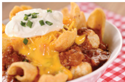
Totchos (Potato Barrels, Corn Chips, Chili and Cheese)

Lasso your hunger with breakfast, lunch or dinner at Woody's Lunch Box, opening with Toy Story Land on June 30 at Disney's Hollywood Studios®. Yee-haw!