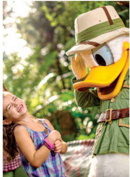
Have a blast with Donald and friends

Don't forget to experience the new UP! A Great Bird Adventure show, give a shout-out to the first anniversary of Pandora— The World of Avatar (be on the lookout for the new Pandora Utility Suit roaming around) and have an all-around wild time during the Park's 20th anniversary celebration.