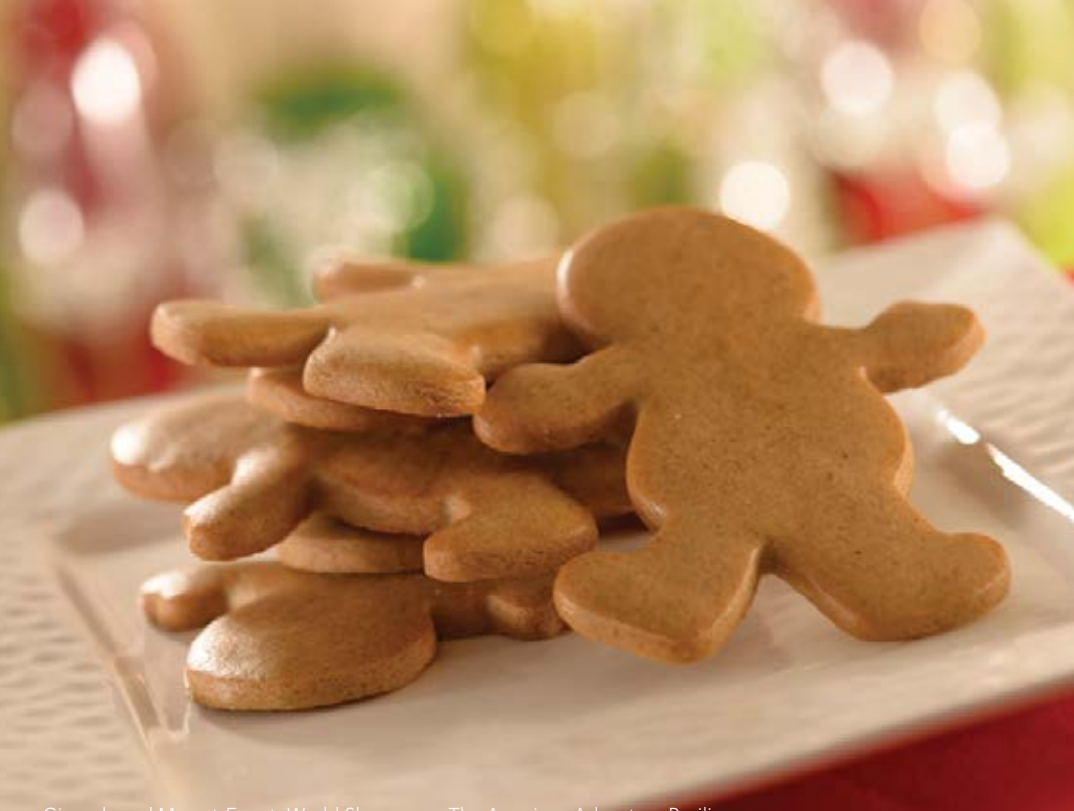
Gingerbread Men at Epcot® World Showcase—The American Adventure Pavilion

Get tasty holiday treats at Walt Disney World Resort beginning November 28 and ending January 2.