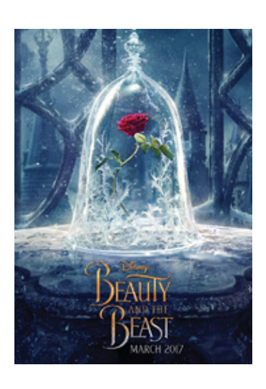
See Disney's Beauty and the Beast at AMC® Disney Springs® 24 when it releases in U.S. theaters on March 17.

For reservations, visit DisneyWorld.com/dining or call 407-WDW-DINE (939-3463).