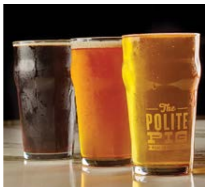
Refreshing beverages on tap

Passholders enjoy 10% off the non-discounted price of food and nonalcoholic beverages at The Polite Pig.