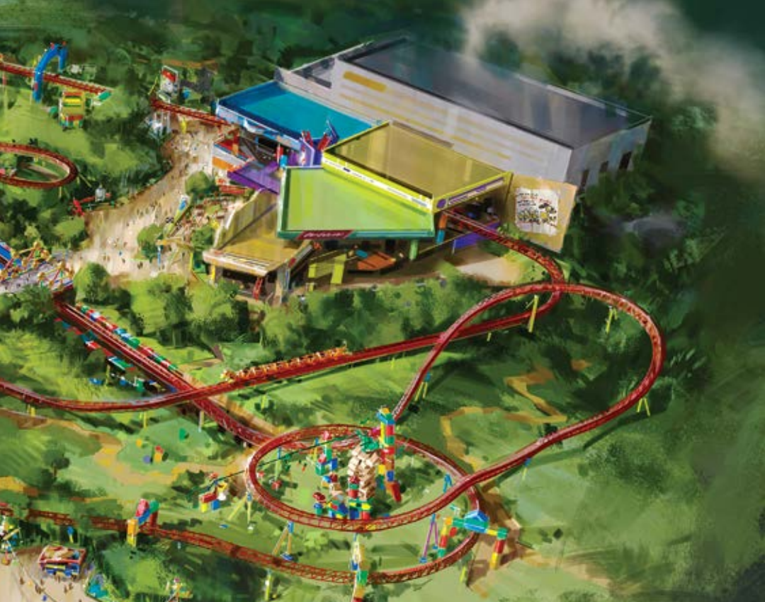
Walt Disney Imagineering Early Concept Art

that Andy has created with his Mega Coaster Play Kit combined with some of his other toys.