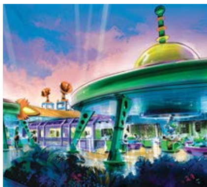
Concept Art for Alien Swirling Saucers

And that's just a peek into the toy box. Look forward to all this and more, coming in 2018.