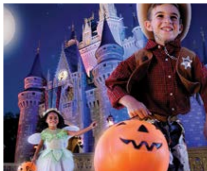
Trick-or-treat at Magic Kingdom ® Park

Then, during the Hocus Pocus Villain Spelltacular , the mischievous Sanderson Sisters from the Disney film Hocus Pocus return to the mortal world with only a short time to run amuck. And in that time, the three sinister siblings decide to use their magic to throw the best Halloween party this side of the boneyard!