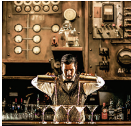
Enjoy craft cocktails at The Edison

Whatever nighttime magic you're after, there's one place you'll find it: Disney Springs® .