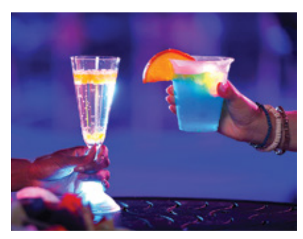
Cheers to Specialty Drinks at The Wharf

Admission to this event requires a separately priced ticket valid only during specific event dates and hours. Savings based on non-discounted price a non-Passholder pays for the same ticket. Entertainment offerings subject to change without notice. Water Parks subject to weather closures.