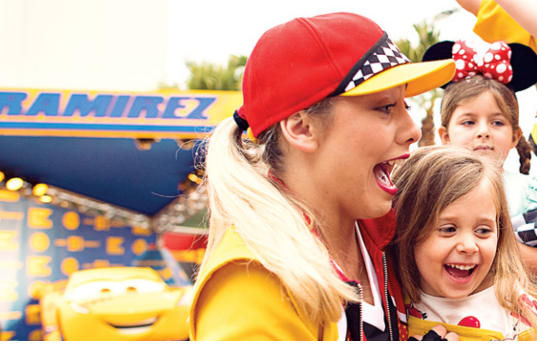
Outside Lightning McQueen's Racing Academy